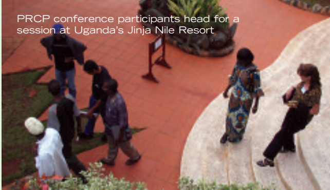
PRCP conference participants head for a session at Uganda's Jinja Nile Resort