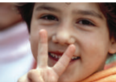
A girl in Jenin, West Bank, makes a peace sign