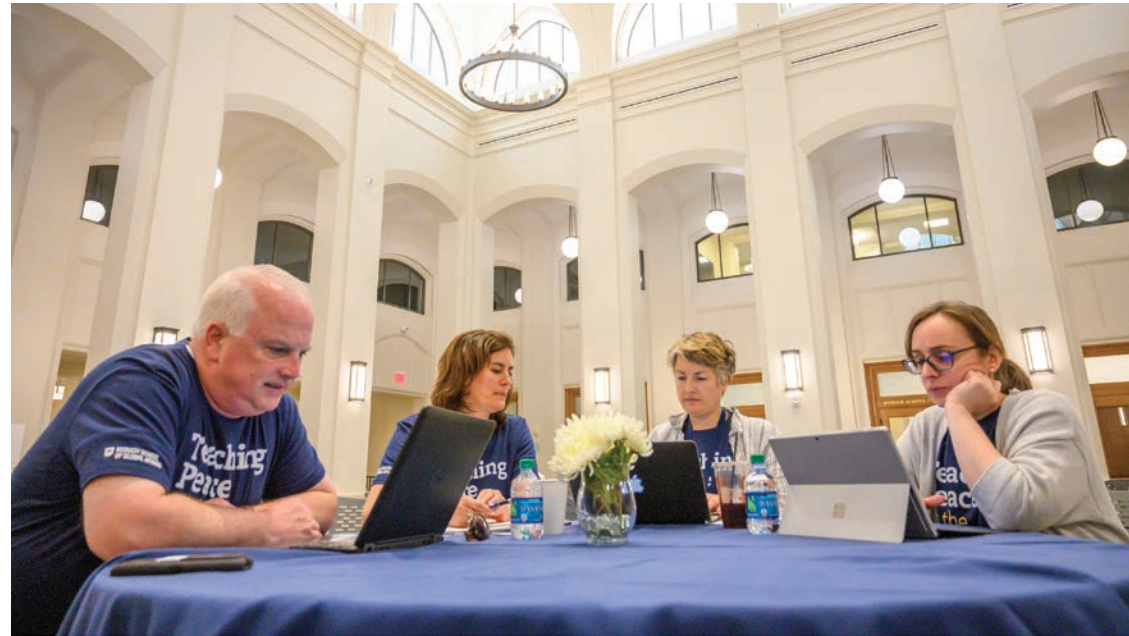
Participants at the 2019 Summer Institute work on their individual projects during free time